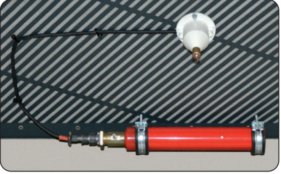
Aerosol extinguishing system

The VDS-tested extinguishing agent LiBa®Sol is 100 % environmentally friendly, does not produce any environmentally hazardous by-products and is absolutely climate-friendly.