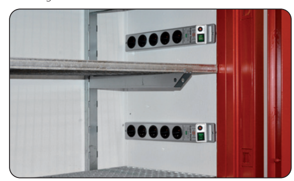
Charging device with socket strip 5-fold