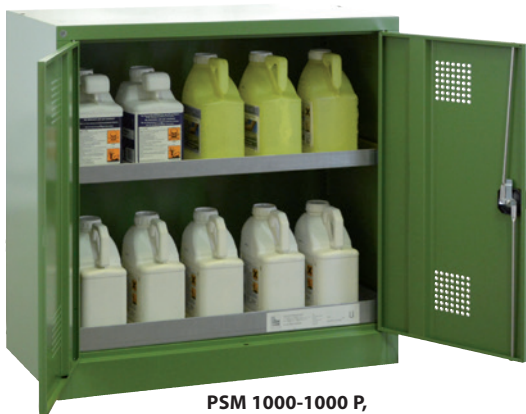
PSM 1000-1000 P, Article no. B80-6556-A