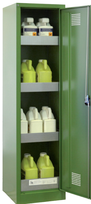
PSM 500 P, Article no. B80-6555-A