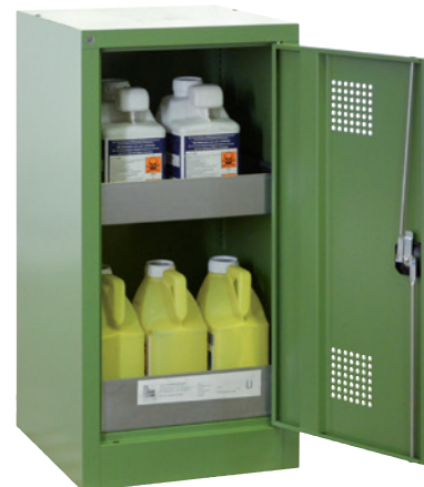
PSM 500-1000 P, Article no. B80-6554-A