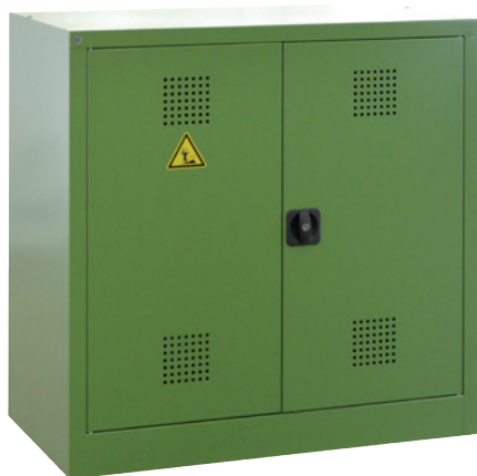
PSM 1000-1000 P, Article no. B80-6556-A