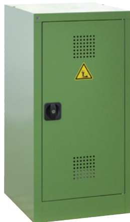
PSM 500-1000 P, Article no. B80-6554-A