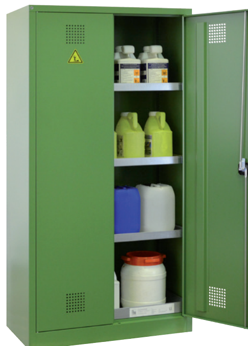
PSM 1000 P, Article no. B80-6557-A